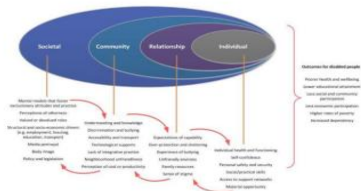
Figure 1: Education

These vary from special universities to full education. With the exception of the very last training gadget, special schools are in early cases, a voluntary submission was made by special schools in the Asian USA. There were about ten unique schools in the Asian United States of America by the usage of the Nineteen Fifties. Thirty years later, in the 1990s, there was a surge in terms of quality. About 1100 unique faculties were produced and the United States spread all spherical faculties. Due to the development of acts Same possibilities, protection of rights and full participation, 1995, policies and consequently the ease of quite a few varieties of professionals qualified to display in special schools, this increase was by and wide. It is laborious to estimate the acceptable range as directories have not been included among those who produced such colleges a few years ago. In addition, the maximum number of them are tested in or agreed with as communities. Therefore, due to poor documentation, there's no acknowledgment of those special colleges. In addition, large parent companies in Asian united states have developed special faculties for young people with intellectual disabilities in many elements of the country over the years, representing the participation of parents.